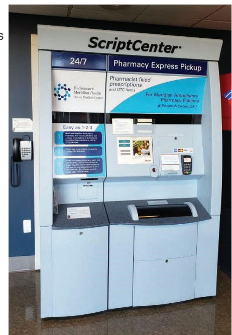
Hackensack Meridian Health - Ocean Medical Center ScriptCenter kiosk

More and more hospitals are uncovering the costs associated with their employees using 'outside' retail pharmacies. There are also challenges around getting prescriptions in the hands of their employees, especially those who work second and third shift. To solve this problem, Hackensack Meridian Health, a hospital and health care system in New Jersey, implemented the ScriptCenter kiosk for 24/7 prescription and OTC pickup.