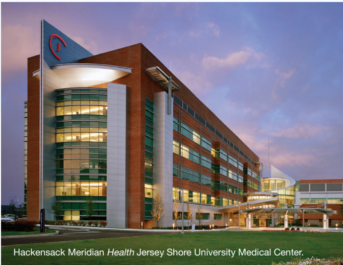
Hackensack Meridian Health Jersey Shore University Medical Center.